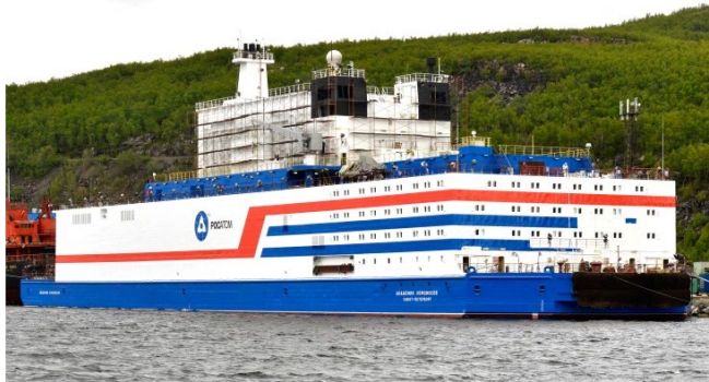
The newly-painted Akademik Lomonosov in Murmansk

Russia's Rosenergoatom has received an operating licence for its floating nuclear power plant, Akademik Lomonosov , from the country's regulator Rostekhnadzor. The facility is 144 metres in length, 30 metres wide and has a displacement of 21,000 tonnes. It has two 35 MWe KLT-40S reactors.